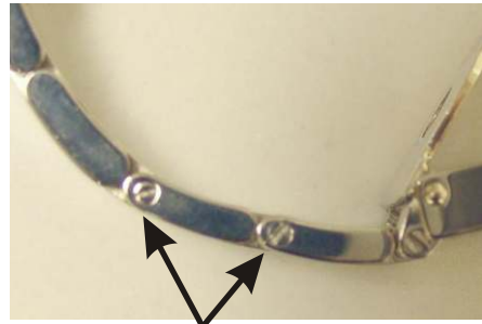
Removeable Links Held By Screws, Not Pins